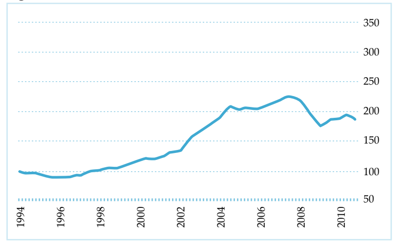
Figure 3. The Economist's House Price to Rent Ratio

Bolstering this view, the number of first time buyers hit record lows in 2007, suggesting that the marginal buyers were struggling to step onto the ladder. At the same time, The Council of Mortgage Lenders said that house prices were 3.29 times the