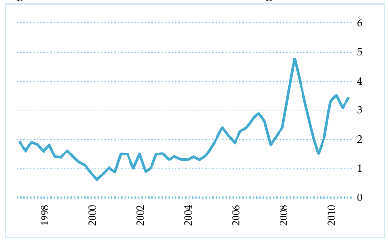
Figure 5. UK CPI (Year-on-Year Percent Change)