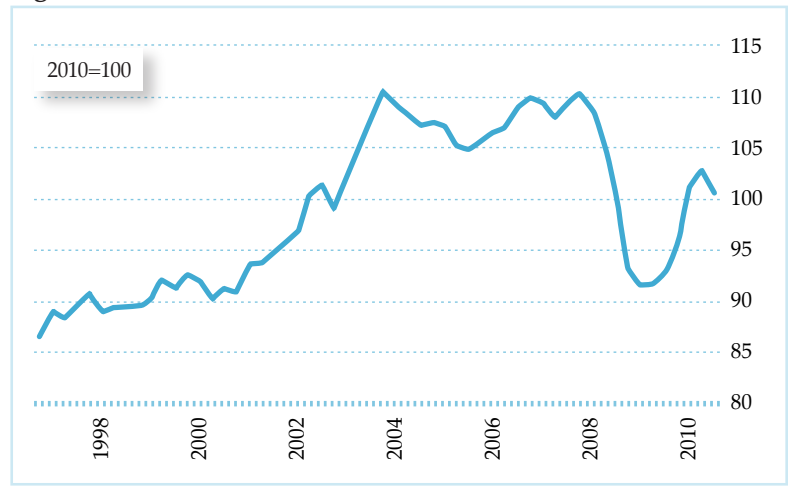
Figure 4. Construction Sector GVA

Figure 4 shows the contribution of the construction industry to UK national income, from 1997 through 2010. The boom phase is clearly evident with a peak occurring in Q1 of 2008. This heralded a collapse back to levels not seen since 2000.<sup>18</sup>