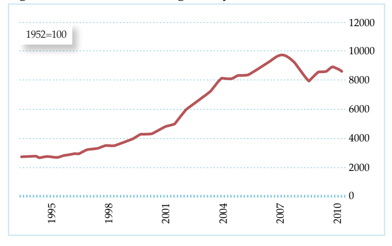
Figure 1. Nationwide Building Society House Price Measure

annual growth in 2007, 2008 saw a fall of 0.8 percent and 2009 saw a fall of 7.6 percent.<sup>6</sup> Figure 1 shows the Nationwide Building Society measure of house prices from 1994–2010.<sup>7</sup>